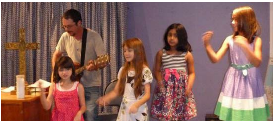
GSP's kids are excited about the new interactive hands-on Children's Eucharist which takes place every fourth Sunday of the month. See Page 5.