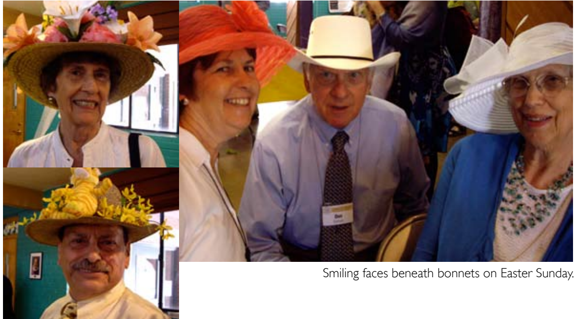
Smiling faces beneath bonnets on Easter Sunday.

Extra hardcopies of the Briefly will always be available at the Welcome Table on Sunday mornings.