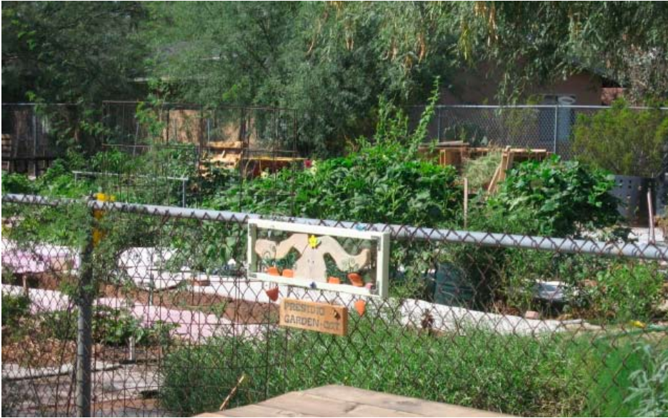
GSP community garden at Presidio Gardens-CGT (above). Late summer crops awaiting fall planting season neighbors (above right).