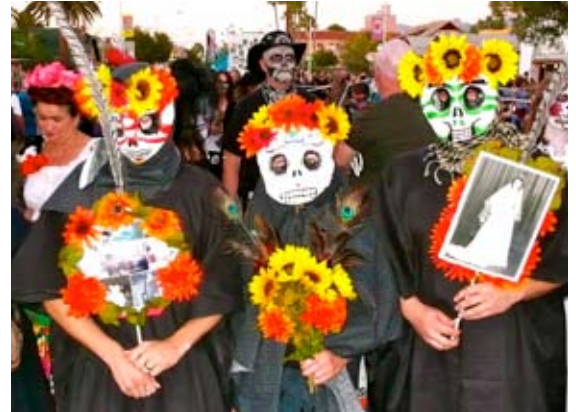
Participants in the All Souls Procession typically dress up in elaborate costumes inspired by Dia de los Muertos, celebrating the lives of those who have passed on and honoring their ancestors.

People who walk in the procession typically wear elaborate costumes and makeup to reflect Die de los Muertos, and often walk with photos and mementos of their deceased loved ones. It's a family friendly event with over twenty thousand participants. There are scores of stilt-walkers and acrobats, along with exotic floats and people of all ages dressed up in ever more creative ways. A ritual for Tucson and a community event creating connections across cultures, the parade also raises awareness of many important issues. Last year, for example, a group gained international media attention for their remembrance of gay youth who had committed suicide after being bullied. In addition, much attention was given to border issues and other social justice causes. The event is organized by Many Mouths One Stomach, and donations are collected along the procession route as well as before and after the